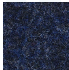
1704 Night Blue