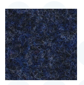
1704 Night Blue