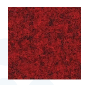
1702 Dark Red